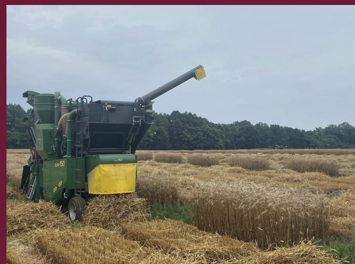
Wheat yield plot harvest