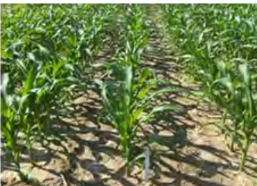
Atrazine (20 fl oz/A) + Dual II Magnum (1.5 pt/A)