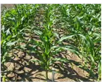
Atrazine (20 fl oz/A) + Zidua (3.5 fl