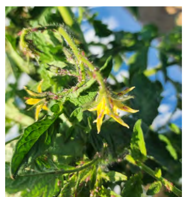
Figure 1. Potato aphids on tomato plant

Thrips: A large number of thrips have been observed in tomatoes the week of June 20th with an average of 145 flower thrips per 20 blossoms.