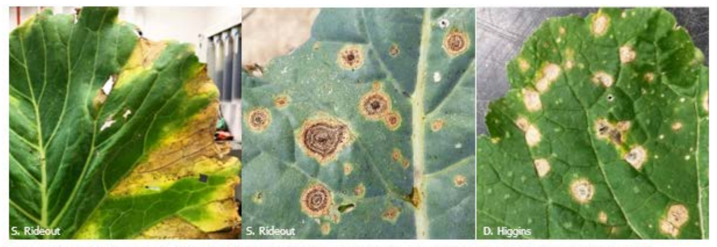
Crucifer leaves with black rot (left) and Alternaria leaf spot (center) and white leaf spot (right).

A few other diseases also affect the foliage of collards and turnip greens including bacterial leaf spot, white leaf spot, anthracnose, white rust, and downy mildew. If you are unsure of what is affecting your collards and turnip greens, contact me at the research station and I can help you figure it out [doughiggins@vt.edu; (757) 807-6584]. If you have a good collards and turnip greens recipe to share, I would be interested to hear about that, too!