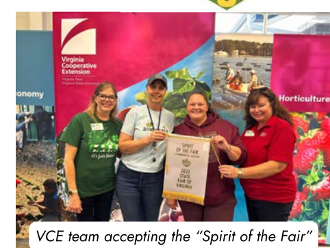
award on behalf of our organization.

Throughout the event we were proud to have videos highlighting Eastern Shore agriculture running on a constant loop that included our potato, snap bean, grain, and aquaculture industries. This year the Virginia State Fair set a record with 210,000 attendees enjoying Virginia agriculture. The largest daily attendance ever was set on Saturday, September 30; the day we represented the Eastern Shore at the Fair, with fairgoers being turned away as capacity limits were reached. Thank you to the many hands that organized the booth and materials throughout VCE; especially the Dinwiddie County Extension Office who designed backdrops, set-up, and disassembled the booth.