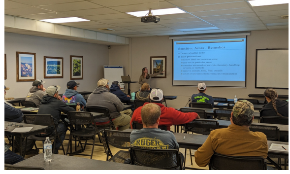
Private Pesticide Training at the Eastern Shore AREC on March 20th. Thirteen attendees received training and tested for the private pesticide applicator certification

Due to the excess amount of rejected containers at the Northampton Landfill, the drop-off storage container will be locked and people recycling will need to either contact Ursula Deitch, 757-678-7946 ext. 25 to schedule an appointment to drop off or go to the sign-in house and ask to have landfill supervisor, Ronald Rowe, come to inspect the containers prior to recycling them. We apologize for this inconvenience, however half of the jugs in the recycling container were rejected.