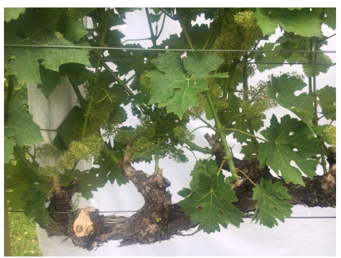
Figure 3. Cab Sauvignon, immediately post-bloom, prior to leaf-thinning.