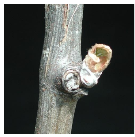
Figure 1. Cutworm damage to swollen grape bud. A tertiary shoot might develop from such a bud, although extensive feeding can eliminate all bud primordia within the compound structure.

Cutworm larvae are about an inch long. They are smooth, brown or gray, and have stripes running the length of their bodies. A quick search around the base of an affected vine can usually reveal the pest. Some of the most heavily damaged vineyards are those where either mulch or weed debris exists around the base of vines. This offers a refuge for the larvae during the day. Feeding begins in the spring when buds begin to enlarge. The extent of damage depends on the cutworm population but also on the duration of budburst. During cool weather, when the period from bud-swell to budburst is delayed, damage can be extensive. Conversely, during hot weather, shoots emerge quickly and damage is minimal. One of the most damaging aspects of cutworms occurs when they feed on cane-pruned vines. Such canes that are deprived of uniform shoot emergence by cutworm feeding may need to be retrained the following year in order to provide uniform spur placement. On the other hand, older vineyards, that normally crop well, may tolerate 5% or more bud injury without adverse impact on yield. Regardless, you need to walk the vineyard routinely after buds begin to swell to monitor for cutworm activity.